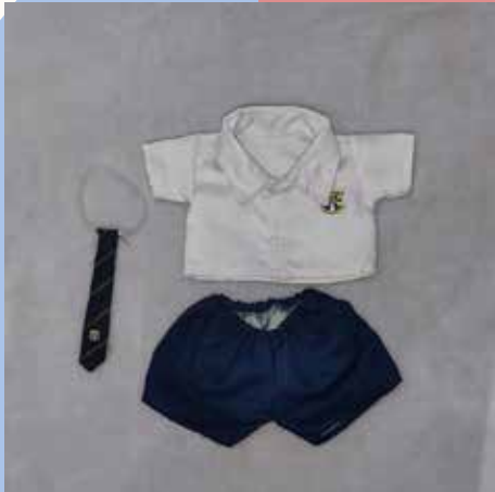
Costume for plush bear