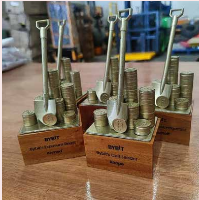
Bitcoin 3D trophy