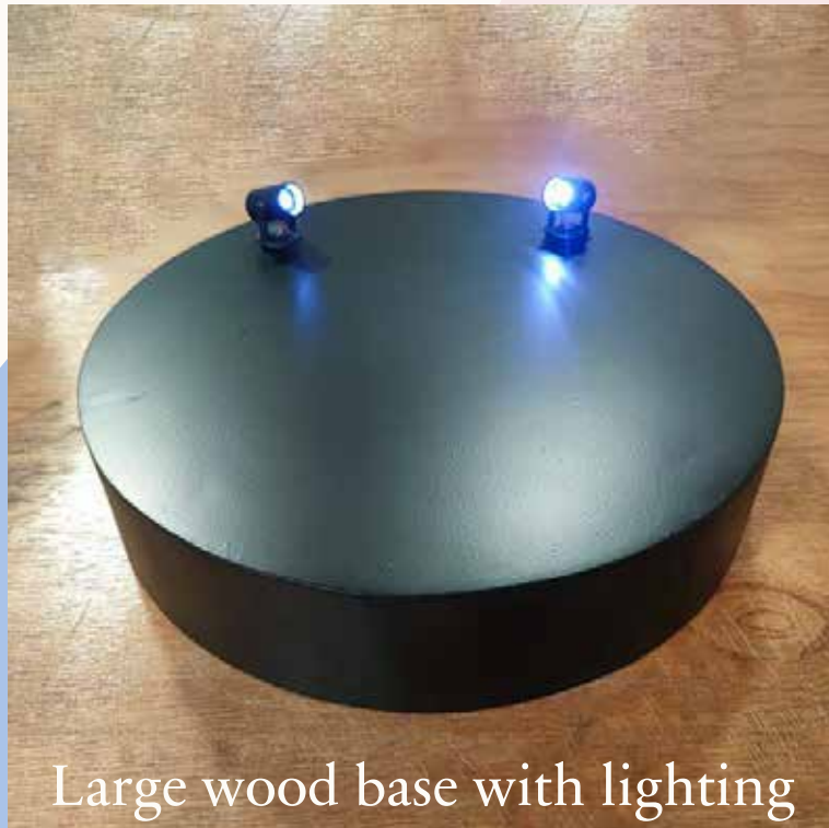
Large wood base with lighting