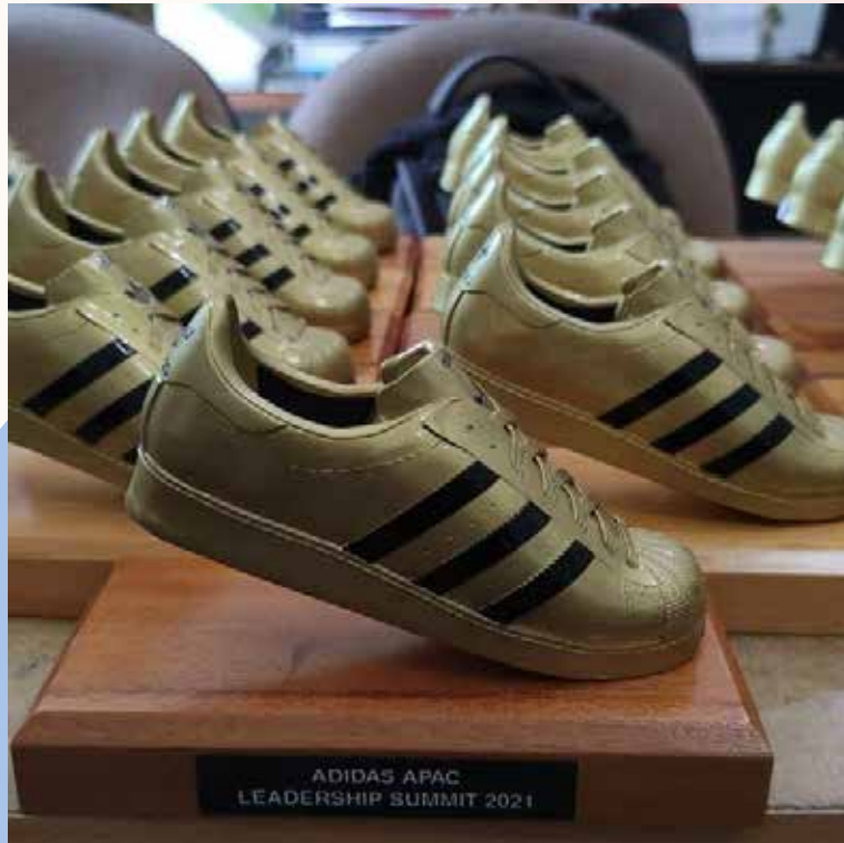
Adidas Shoe Trophy