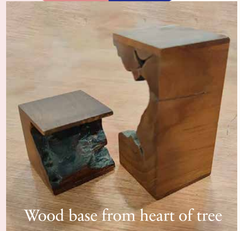
Wood base from heart of tree