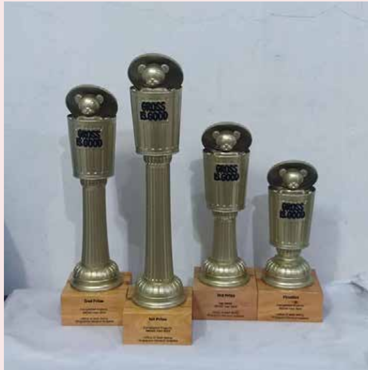
SGH 3D Trophy