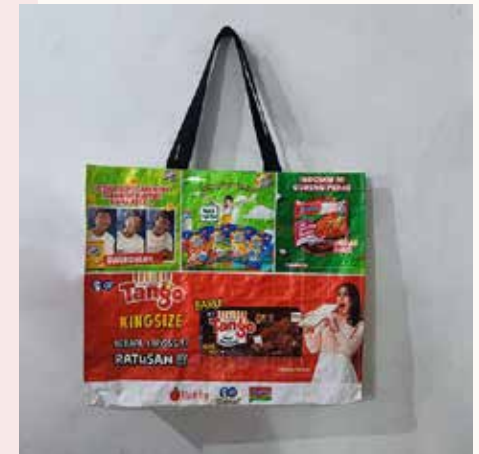
Small order shopping bag