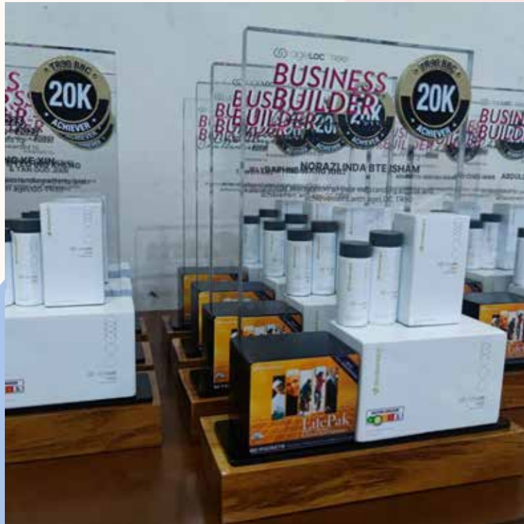
NUSkin 3d Trophy