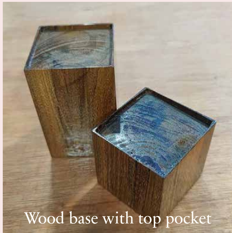
Wood base with top pocket