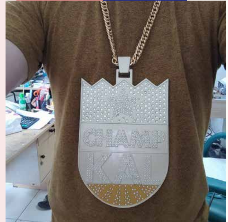
Large Appreciation Medal