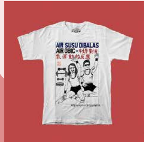
Tee shirt with printing