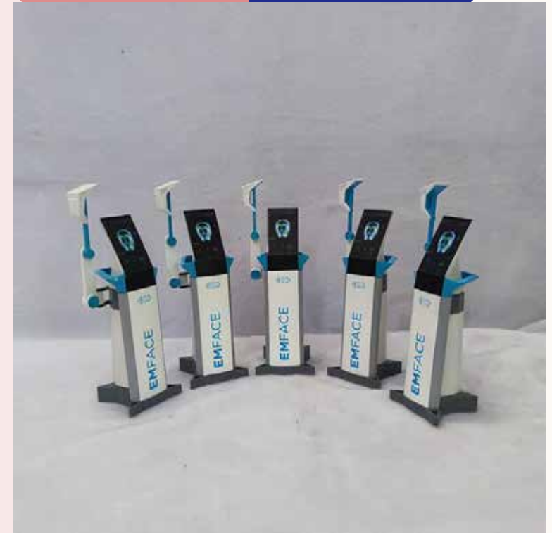
BTL 3D Trophy